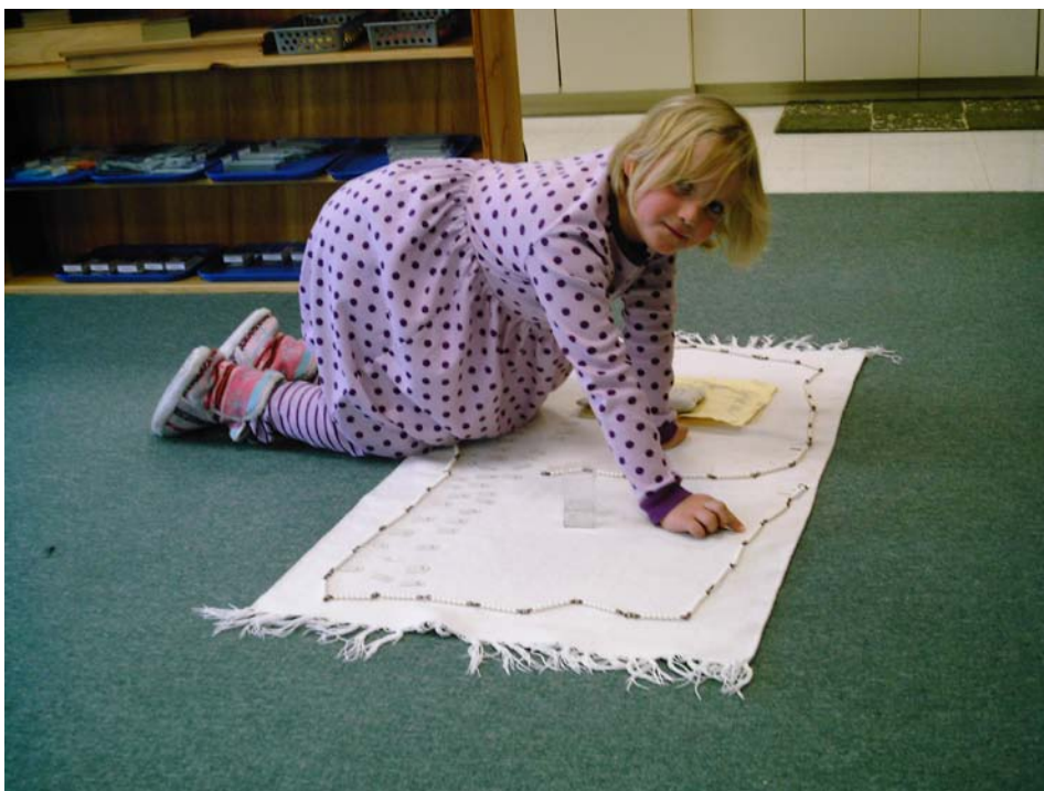
The seven bead chain: Another way to teach multiples of seven.

Thank you for your support. Lower Elementary Staff