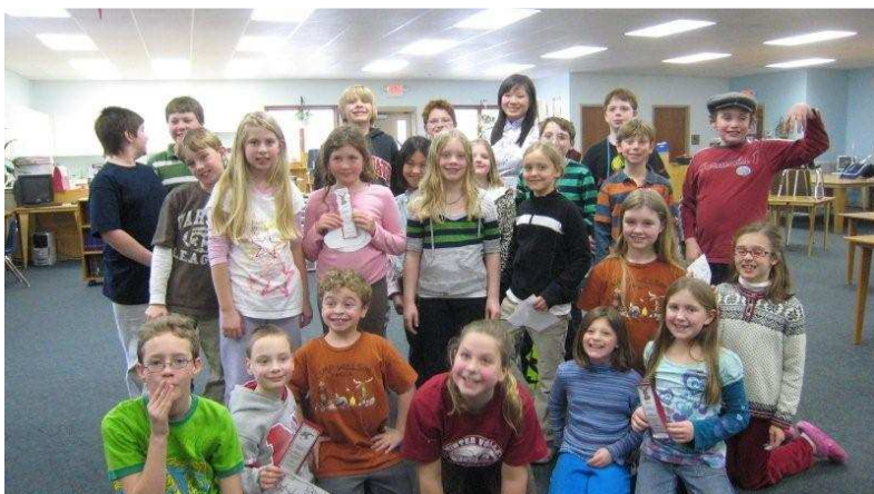
Our class had a fun time learning about Chinese culture.